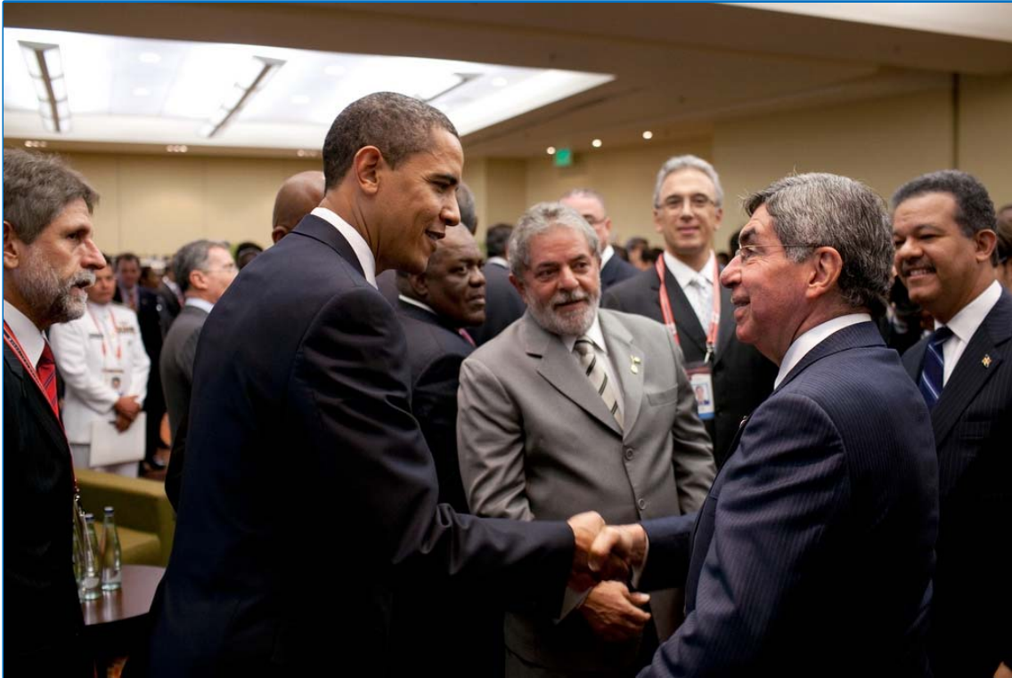
Image 7. Presidents Obama, Lula, and Arias at the Summit of the Americas in Trinidad and Tobago 21 .

image, observing the handshake between the U.S. and the Costa Rican Presidents. The Brazilian president is included as a mediator of the relations between the United States and Latin America.