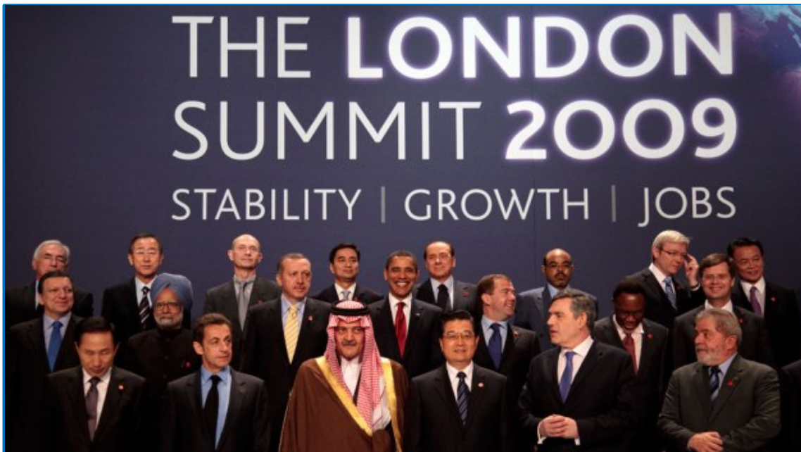
Image 6. G-20 Meeting in London, a group formed by leaders of 19 countries with the largest economies plus the European Union 17 .

The first of these international meetings is that of the Progressive Governance Summit, held in March 2009 in Viña del Mar, Chile. In this post, the Democrat Vice President Joe Biden poses smiling at the center, accompanied by heads of State from Brazil, the UK, Norway, Argentina, Spain, and Uruguay 18 . The next meeting to be registered is the G-20 meeting in April 2009, in London. In this post (Image 6), the Brazilian and U.S. Presidents are with the other heads of State, preparing for the official photo of the event. Barack Obama smiles at the center, surrounded by the leaders of the other countries; the Brazilian President is at the lower right corner. The publication on Flickr provided, among other hypertextual links that are unavailable for access, a link to a post in English on the White House blog 19 . In it, a video is available with the full speech by Barack Obama during the event and some textual clippings of speeches by the U.S.