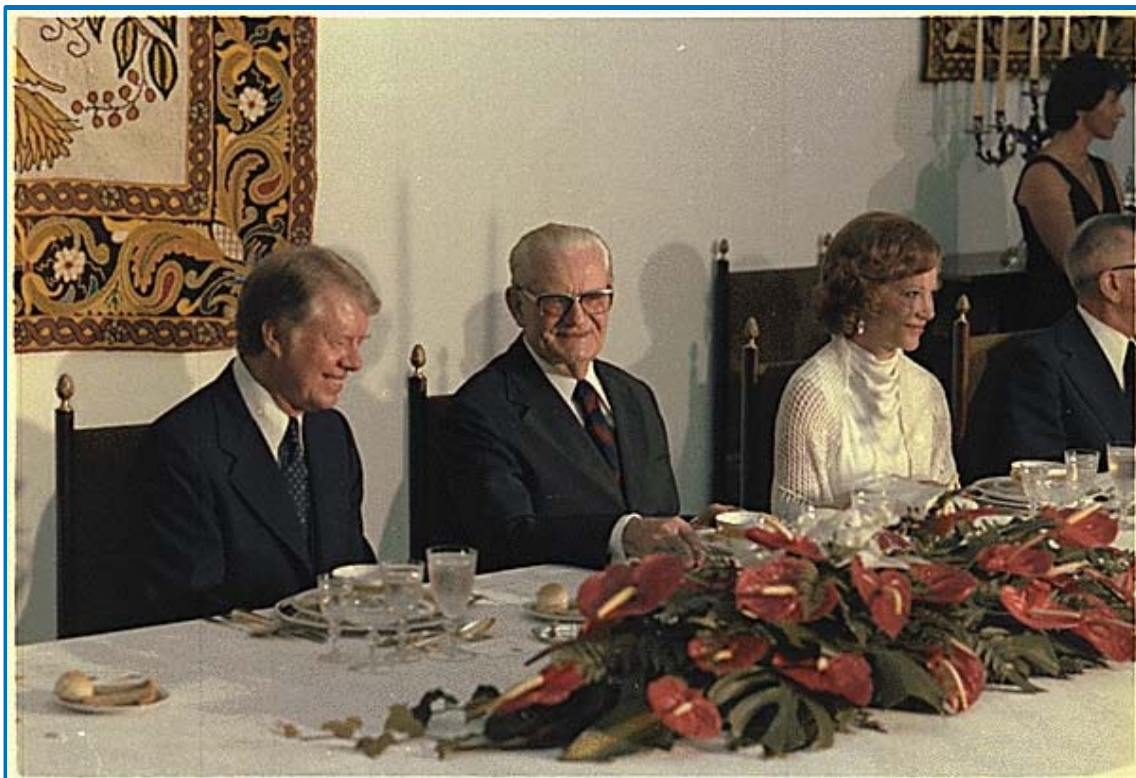
Image 3. Official dinner for the Democrat Carter and General Geisel, the only publication in the album dating back to the time of the Brazilian military dictatorship 8 .

the Brazilian parties that take control of the federal government define themselves as opposed to the regime established by the 1964 civil-military coup d'État . The publication concerned differs from the others also due to the image format. While the others use the JPEG standard - which holds up to 16 million colors -, even the oldest ones, the fourth is published in the GIF format, with low visual quality. For the dinner held by the General to the Democrat President, and his wife, there was a small image with saturated colors. In this memory, constructed on the internet, the 21-year dictatorship is addressed by silence and oblivion. This way, an absent character stands out: the Democrat Lyndon B. Johnson, who was at the White House between 1963 and 1969. His administration, Michel Weis (1993, p. 166) underlines, continued outlining the 1964 coup , which overthrew João Goulart and led military commanders to seize power in Brazil. While Carter's visit to Geisel, in 1978, is a marginal aspect of this memory, the close relations between the Brazilian dictatorship and Lyndon Johnson administration are completely erased.