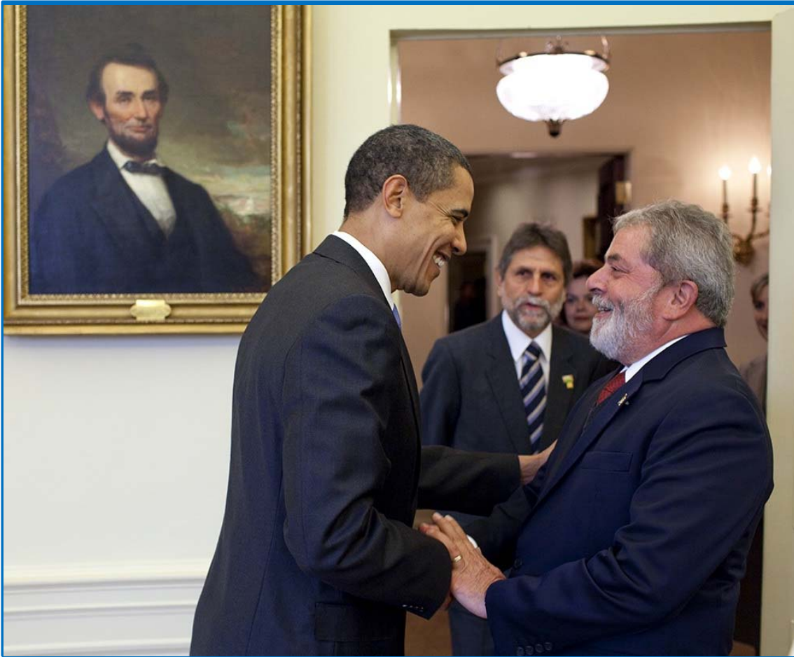
Image 1. Barack Obama greeting the then Brazilian President, Luiz Inácio Lula da Silva 4 .

The first photograph in the album is also its cover; it is a presidential meeting between Barack Obama and Luiz Inácio Lula da Silva. In it (Image 1), both Presidents smile while shaking hands cordially at a hall of the White House. In the background there are other people, such as the then Brazilian Ambassador in the United States, Antônio Patriota, and the then Chief of Staff of the Presidency of the Republic, Dilma Rousseff. In the foreground, above the Presidents, there is the only figure in the composition, which gazes at the photographer, a picture of former President Abraham Lincoln, one of the strongest myths in the U.S. political pantheon. Historian Raoul Girardet (1987, p. 13) points out political myth, among other aspects, as fabulation of reality, with a legendary