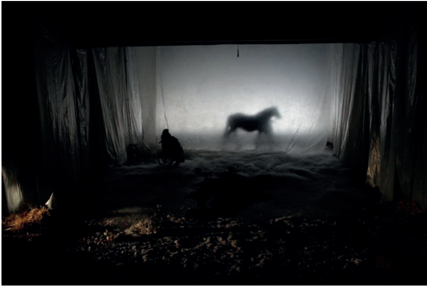
Figure 4 - Gulliver's Travels . Director: Silviu Purcarete. National Theatre, Radu Stanca, Sibiu (Romania).

The transformation of the mimesis concept to an anti-mimesis (Brecht) or post-mimesis/post-anti-mimesis (post-meta-theatre) is a consequence of the transformation of how the audience identifies itself with the story/action or characters of a theatre show. This also meant replacing the traditional effects achieved by identification with the extra-scenic elements (plot, characters) by the direct identification with the artist that stage up the play (director's vision and aesthetics). This kind of performance is no longer based on the mimesis concept but it is directly dependent/ contained in a specific shaped "emotional" form.