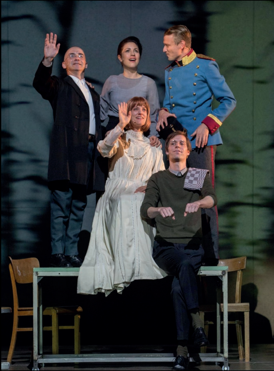
Figures 1, 2 and 3 - Beware Of Pity. Director: Simon McBurney. Schaubuhne, Berlin (Germany).