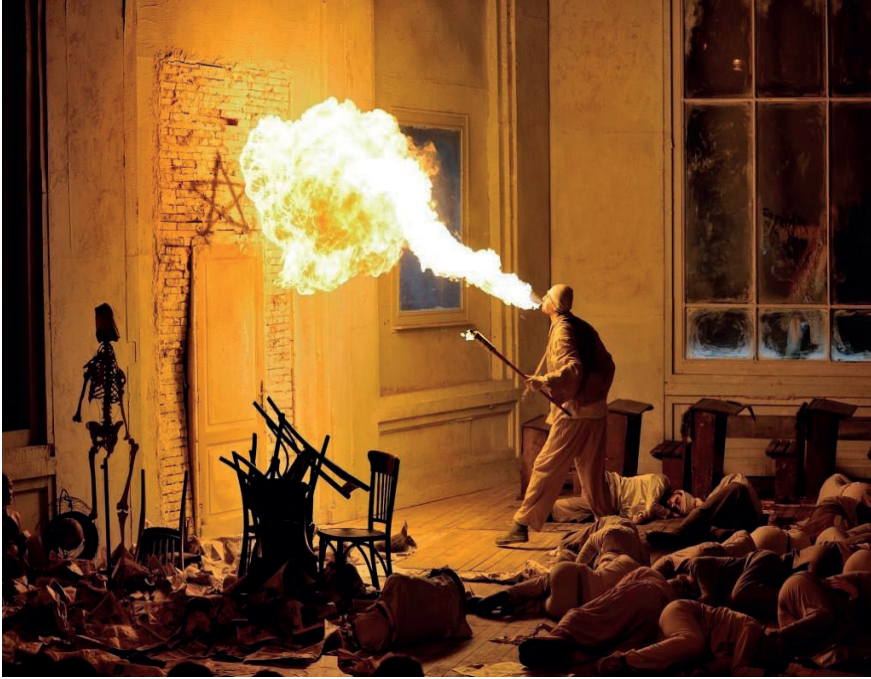
Figures 6 and 7 - Faust . Director: Silviu Purcarete. National Theatre, Radu Stanca, Sibiu (Romania).

It is important that it is not enough to put together different arts, it is not about mixing procedures or means of expression specific to different arts. It is about an alchemic process based on a denominating process (like in Grotowsky's via negativa ). One has to give up to all unnecessary details in order to find out the principle, the common fundamental unity of imagistic and sensorial elements of a show. This “morphemes” have the capacity, as Artaud believed, to reach the audience at a visceral level, without being “translated” by the conscious mind, generating a catharsis or an “ecstatic explosion” of the audience as a whole.