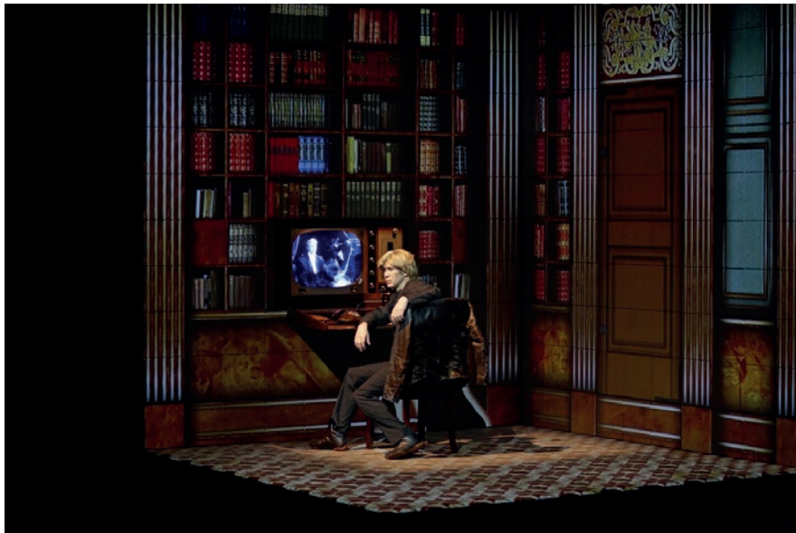
Figure 5 - Hamlet . Director: Robert Lepage. State Theatre of Nations, Moscow (Russia).

We can all agree that theatre for the sake of the artist is a remote dream of the “childhood” of the vanguards. New forms of theatre bring the idea of re-mastering the spectators in terms of receptivity and interactivity by forcing them to give up to illusion and empathy. It is step forward from the Brechtian epic theatre, where the verfremdungseffekt was based on the fragmentation of the action with the help of songs or placards. In post-dramatic theatre, the visual continuity of theatre is rejected. The image itself can be divided or multiplied, and this technique eliminates the necessity of classical time and space unities. The scenic action is re-constructed from parts or segments perceived in separate registers (of the eye, ear or emotional) not as a rational discourse, but as a result of the inner psychology or motivation of the characters.