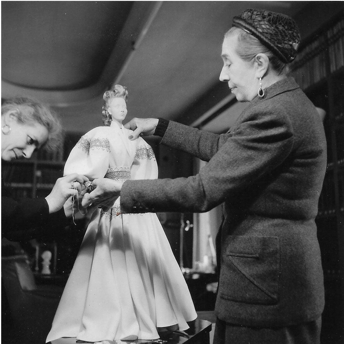
Image 1: Portrait de la couturière habillant une poupée du théâtre de la mode en 1945