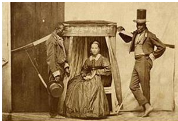
Image 4 - Woman with her two slaves in Bahia (Brazil), 1860.