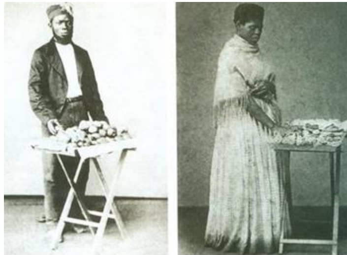
Image 3 - Slaves selling their products, Rio de Janeiro (Brazil), 1860.