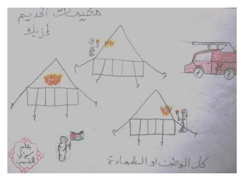
Fig. 06: Children's drawings: Extraordinary events in relation to persecution, flight © Rolf Laven

Here a drawing is recorded that tells about the expulsion and flight suffered generations before. The drawings are based on the families' past experiences.