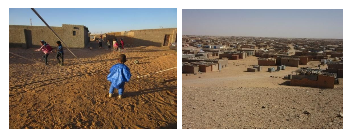
Fig. 01: Living situation in the camps of Smara, Feb. 2017 (©) Laven Fig. 02: View of the Aswerd Refugee Camp, Feb. 2015 (©) Laven

The Graphic Novel as a development of the last decades and now an independent art form, is the focus of this text. This term is to be understood as graphic storytelling and refers to the most important condensed stories, which occur in a variety of drawing variants, from black and white drawings to many-colored chalk works.