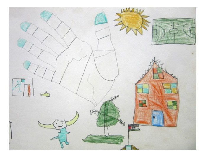
Fig. 09: Children's drawing: Imagined (house with pointed roof, green football field, tree) and real conditions (billy goat, house, tent, flag) are equally important in the picture