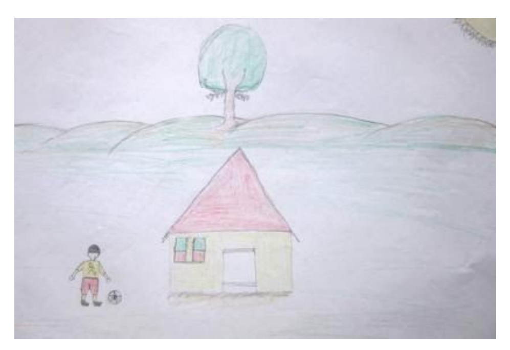
Fig. 07: Children's drawings depicting things that do not exist locally and in the actual experience of the people © Rolf Laven