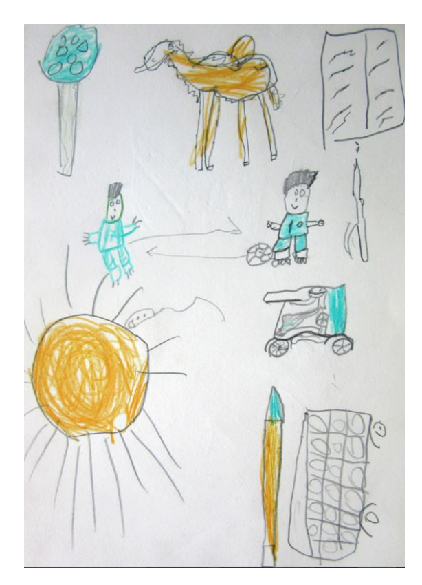
Fig. 08:- Children's drawing: narration about children's (experience) life: Imagination and Real-Thing Environment © Rolf Laven