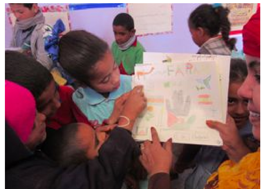
Fig. 03: Participants exchange information about the pictures they have taken. Appreciation of the children's pictorial work comes into play.

therefore the brightest area of the classroom. Religious and political motifs can be seen on the walls, as well as a map showing the original course of the border, rows of self-made, foiled drawings and illustrations of green parks and Baroque palace buildings.