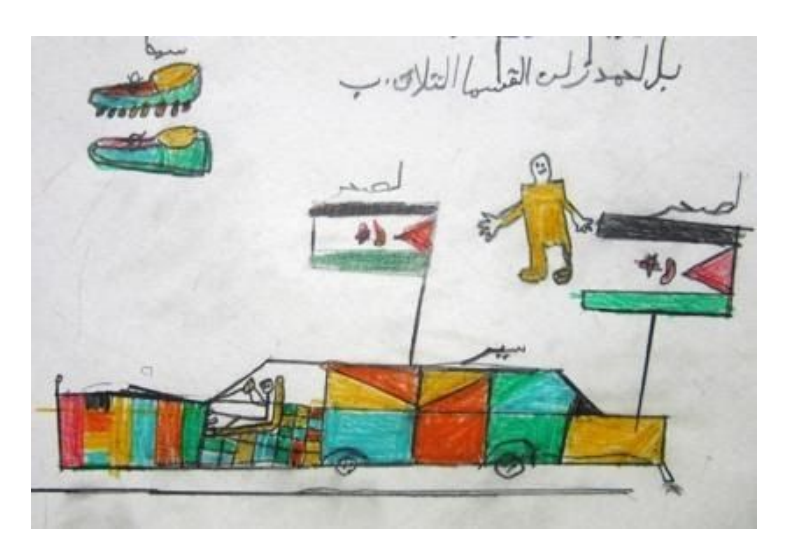
Fig. 05: Motifs such as the tent, flag, and car of a person in authority are depicted © Rolf Laven

As the author was able to experience for himself, the Saharawi flag is present at the morning roll call, before classes begin. The flags are an important part of the local experience. Other pictures show the palm of the hand, sometimes in the colours of the national flag.