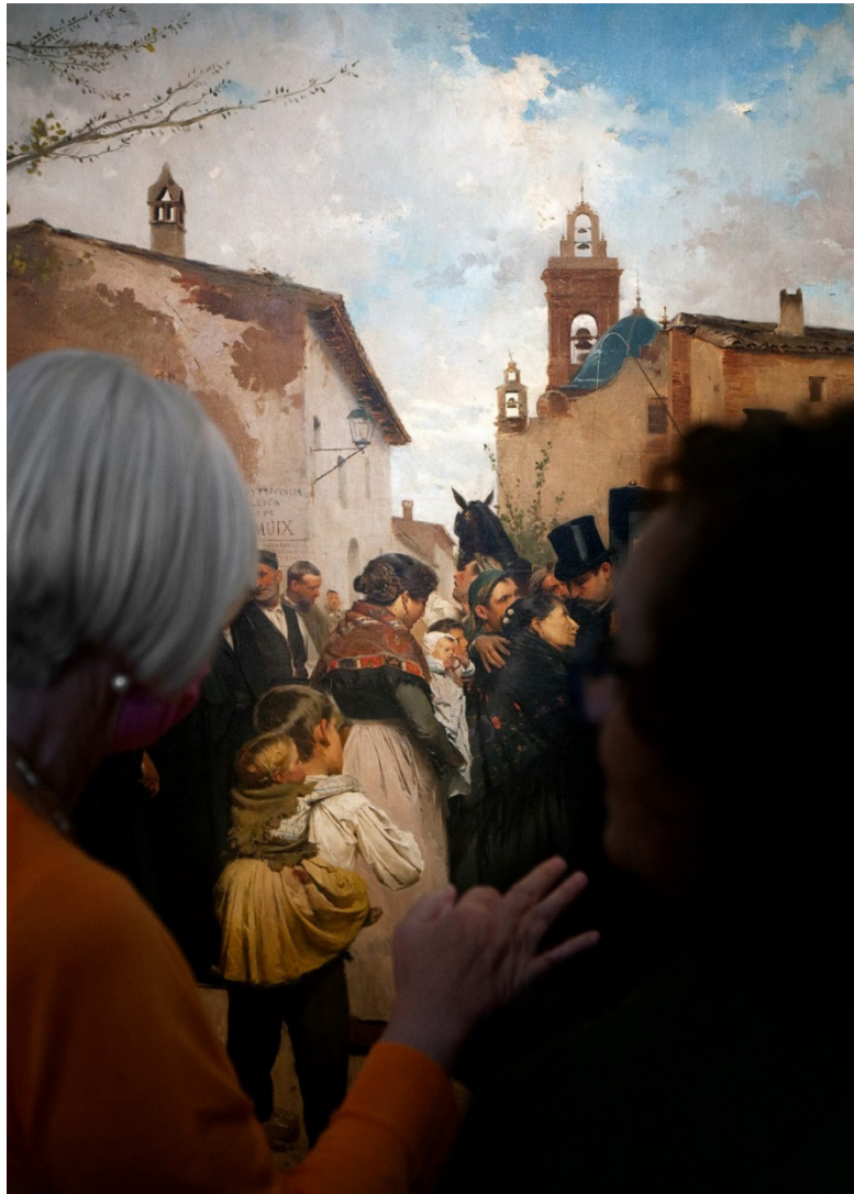
Fig. 5. People observing the painting The glory of the people (1895) by Antonio Fillol Granell, in the permanent exhibition of the Valencia Museum of Fine Arts.

and discoveries that tell us about social relations, how we observe the city, the way we live in it. In educational research, it is convenient to establish and connect with educational practices, since these same practices, based on ethnographic and artistic visual research, are articulated in turn in the double axis of research, teaching and the improvement of their own, integrating practices in their environment.