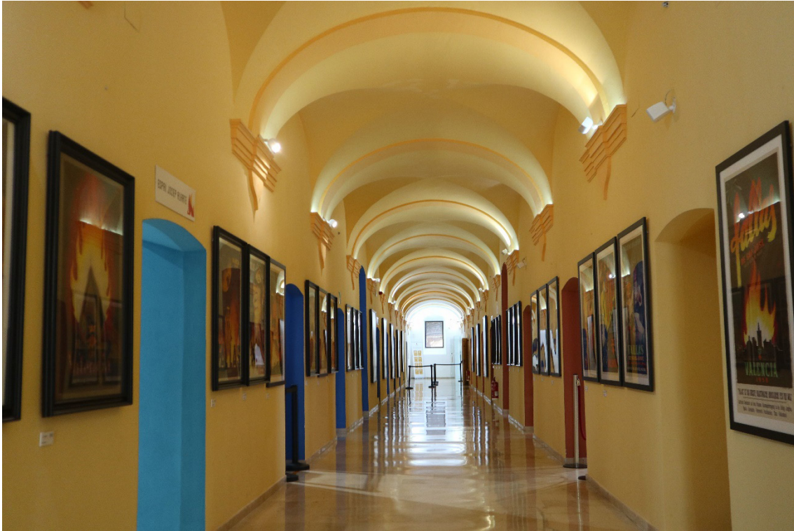
Fig. 1. Photo of the Museu Faller. Author: Arcadi Cotolí Melià.

The most intense and rewarding part of the process is choosing a single photograph, forcing students to question many aspects of their own creations (Barthes, 2009). The number of photographs uploaded (17 per museum) allows for an explanation in the classroom, with enough time to analyze each image, encouraging the teacher to generate debate among the students (Souza, Salgado, Chamon & Fazenda, 2022). It is from their images that we address formal issues, content, semiotics and symbologies. For example, in the case of the images of Arcadi Cotolí [figure 1], the importance of geometry in the creations of this mathematics teacher was commented. In addition, we take advantage of some element of each photograph to talk about artists who use photography as a means of expression.