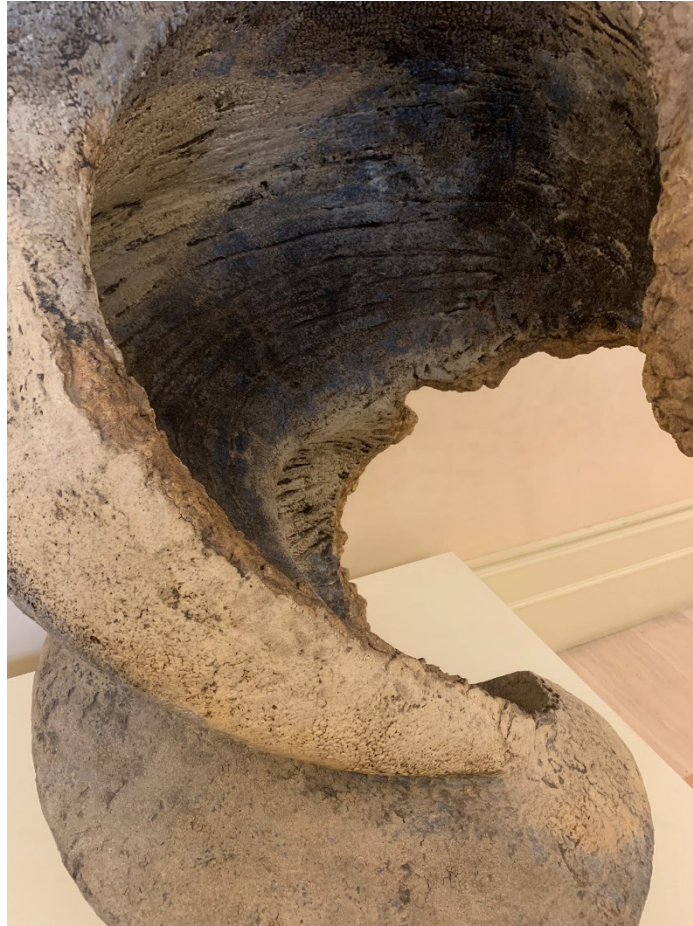
Fig. 2. Photograph of a piece from the Museu de Ceràmica. Author: María José Tamarit Moradillo.

The work develops an analysis of the value of the photographs taken during the drift, as a means to investigate the social environment from the lived experience (Sutton, 2020). It is investigated from an ethnographic, narrative and artistic perspective, involving all the research agents in the construction of an active story that is complemented and built in different phases: search, analysis and selection of images, discussion, analysis and joint reflection with the group (Ramon, 2021).