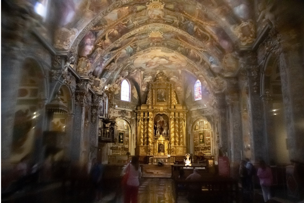
Fig. 8. Interior of the Church of San Nicolás, in Valencia.