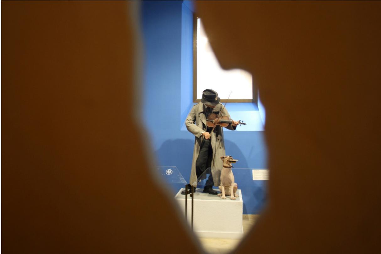
Fig. 3. Assembly of the room in the permanent exhibition of the Museu Falla. Author: Miguel Marin Jimenez.

Collecting photos that have been taken of the exhibitions set up in museums allows us to prepare detailed reports on the discussion processes, based on the analysis of the photographs presented by the students. It is convenient to influence this process as one of the keys of the investigation, since it generates a pedagogical practice in which the result is a conscious learning process, based on an auto-ethnographic visual story. The use of digital technology to take the images and share them with the group promotes an exchange of mutual knowledge (Haraway, 2019).