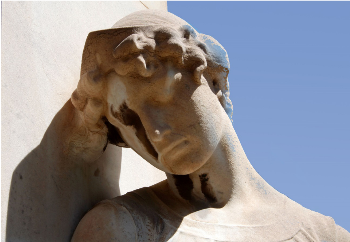
Fig. 9. Photograph of a sculpture detail in the Grau de València Cemetery.

light entered the workshop, as well as numerous materials that the artist used to paint, highlighting elements of costumes and props with which he dressed their models. It is also worthwhile as a space to photograph the cemetery, a place where memory is very present [figure 9].