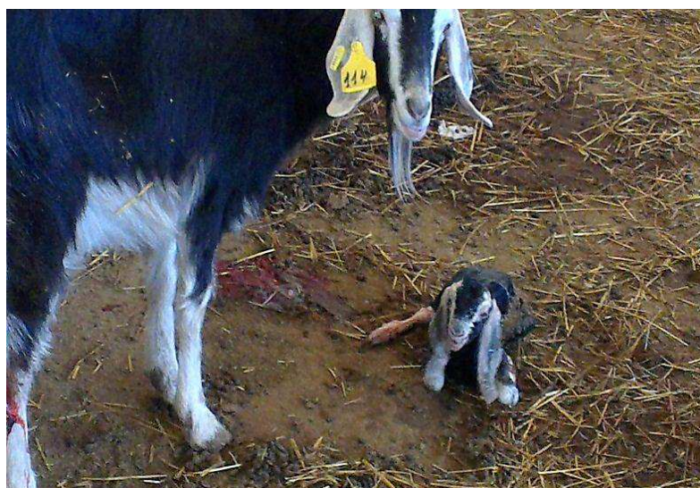
Figure 1. A doe from the flock just gave a birth.

The experiment involved 81 goat kids ( Capra hircus ) of the indigenous Arbia breed (Figure1) raised in a high-input, zero-grazing system.