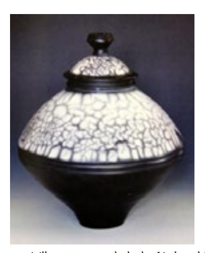
Image 5: Jar, terrasigillata, one-step naked raku, Linda and Charlie Riggs

Factors that influence the acquisition of a successful 'naked raku' product are as follows: the type of the clay which is used in shaping, constituents of the slip which is used in firing, how the firing is done, the care given in the removal of the piece from the oven in terms of how quick it is being removed and in the placement of the piece to the reduction box in terms of how well its physical condition is preserved.