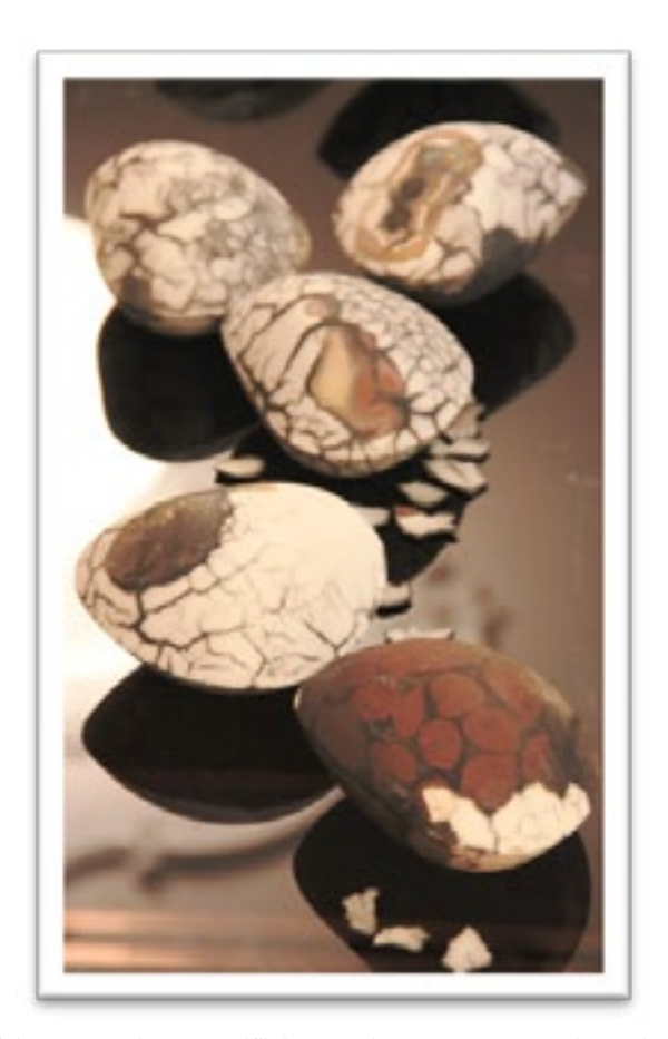
Image15: "The Hearts Believe in Itself", Slip Casted Stoneware, Terrasigilata, Naked Raku, Each piece:13,5x10x10 cm., Installation: 30x89,5x10 cm., Photography: Şirin Koçak

Şirin Koçak does applications of one and two step naked raku firing, preparing slips of varying density on biscuit fired ceramics and getting different results for each level of density. With the slip and glaze recipes she develops, she produces works with varying surface qualities.