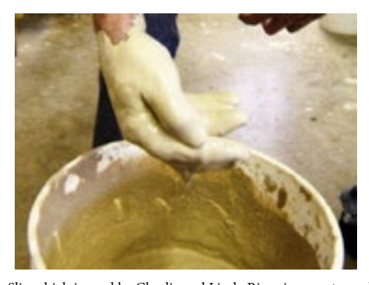
Image 3: Slip which is used by Charlie and Linda Riggs in one-step naked raku

The slip which is defined as 'clay' or 'watered clay' by Charlie Riggs is of a very dense character. (See image 3)