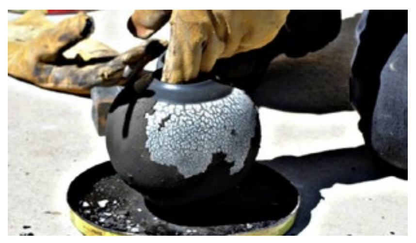
Image 4: Charlie and Linda Riggs's one-step naked raku, slip after reduction